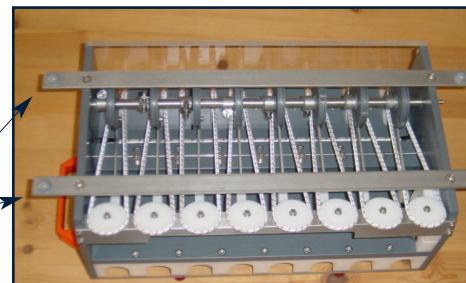
Syringe Sampler, bottom view